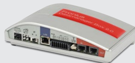
/ Fronius Datamanager Box 2.0